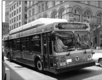
Silver Line vehicle

Air travelers can now get to the airport from downtown Boston in about