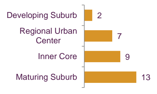
FIGURE ES-2 MPO MUNICIPALITIES CONTAINING FFYS 2018-22 TIP PROGRAM PROJECTS, BY MAPC COMMUNITY TYPE

high-density, built-out Inner Core communities to Developing Suburbs with large expanses of vacant developable land. Figure ES-2 identifies the type of communities—as defined by the Metropolitan Area Planning Council (MAPC)—that will receive these investments.